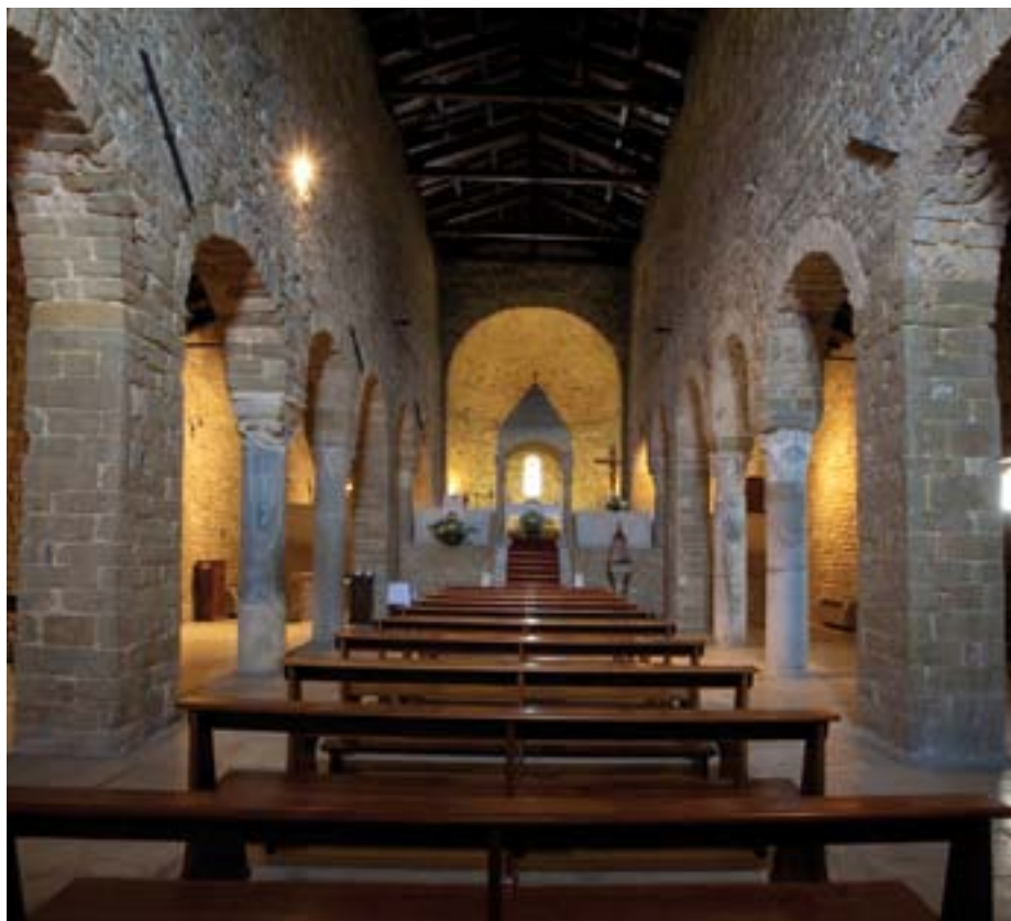
above inside the parish church of San Leo on the left the Chapel of Our Lady of the Water, Malatesta Temple in Rimini