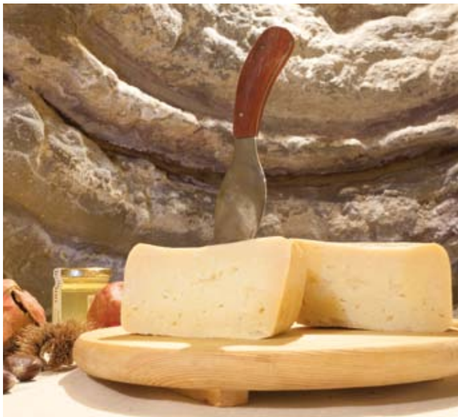
above Fossa cheese, christened “Ambra di Talamello” by the poet Tonino Guerra on the left the delicious olives of the hills of Rimini