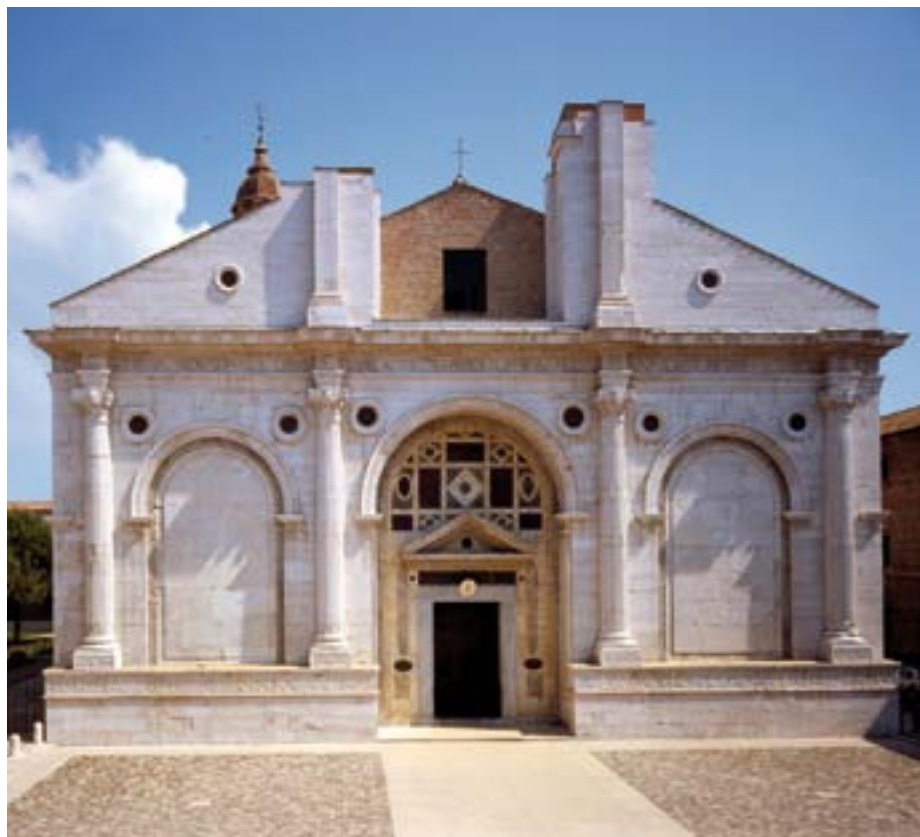
above the Malatesta Temple in Rimini on the left Sigismondo Pandolfo Malatesta (a detail) in the fresco by Piero della Francesca, Malatesta Temple in Rimini