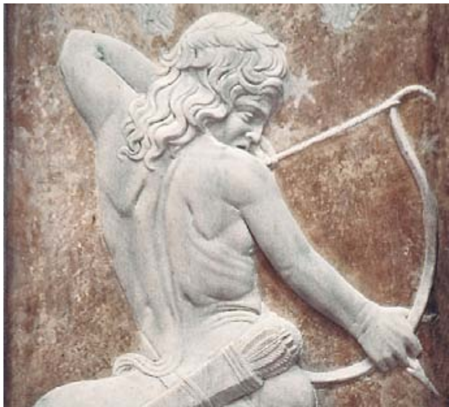
chapel known as “Chapel of the Planets”: detail of a bas-relief by Agostino di Duccio, Malatesta Temple, Rimini