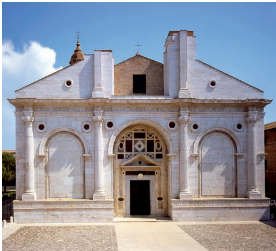
above the Malatesta Temple in Rimini on the left Sigismondo Pandolfo Malatesta (a detail) in the fresco by Piero della Francesca, Malatesta Temple in Rimini