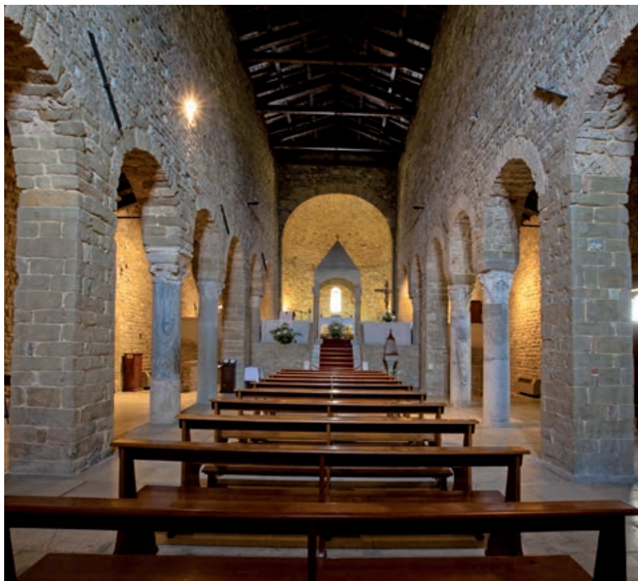
above inside the parish church of San Leo on the left the Chapel of Our Lady of the Water, Malatesta Temple in Rimini