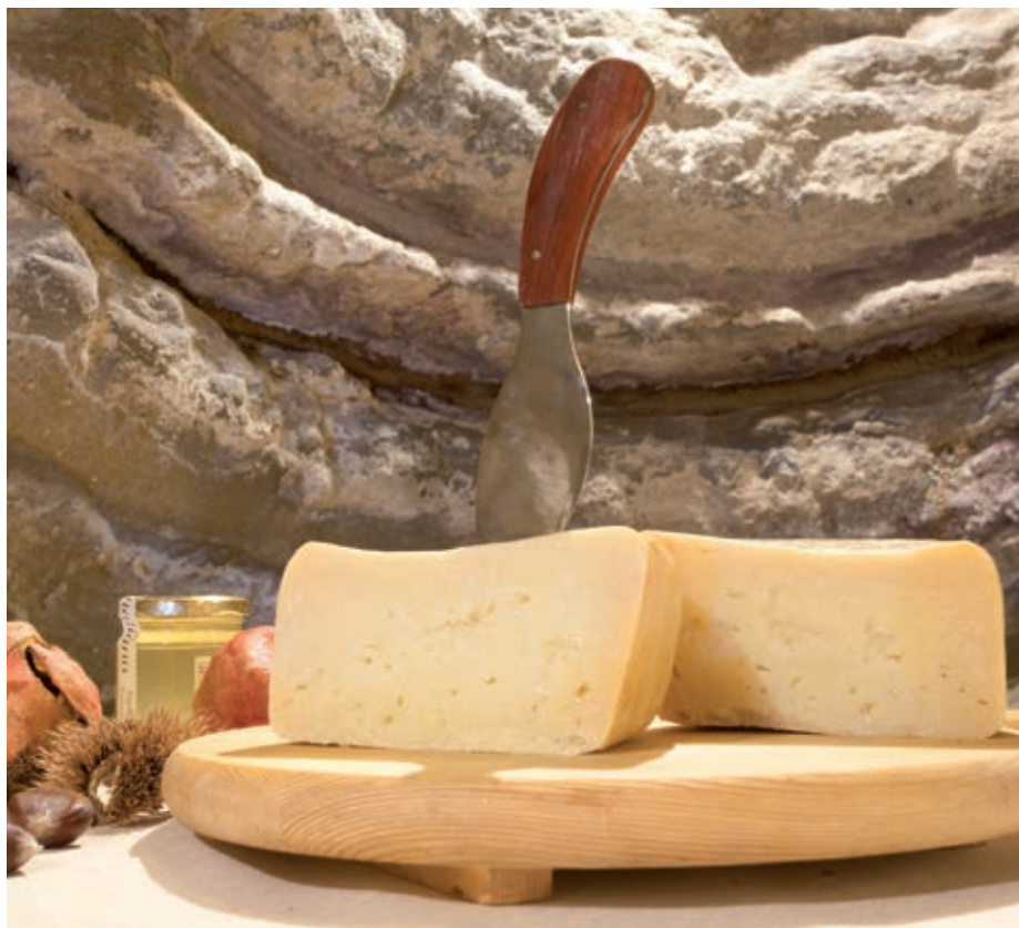
above Fossa cheese, christened “Ambra di Talamello” by the poet Tonino Guerra on the left the delicious olives of the hills of Rimini