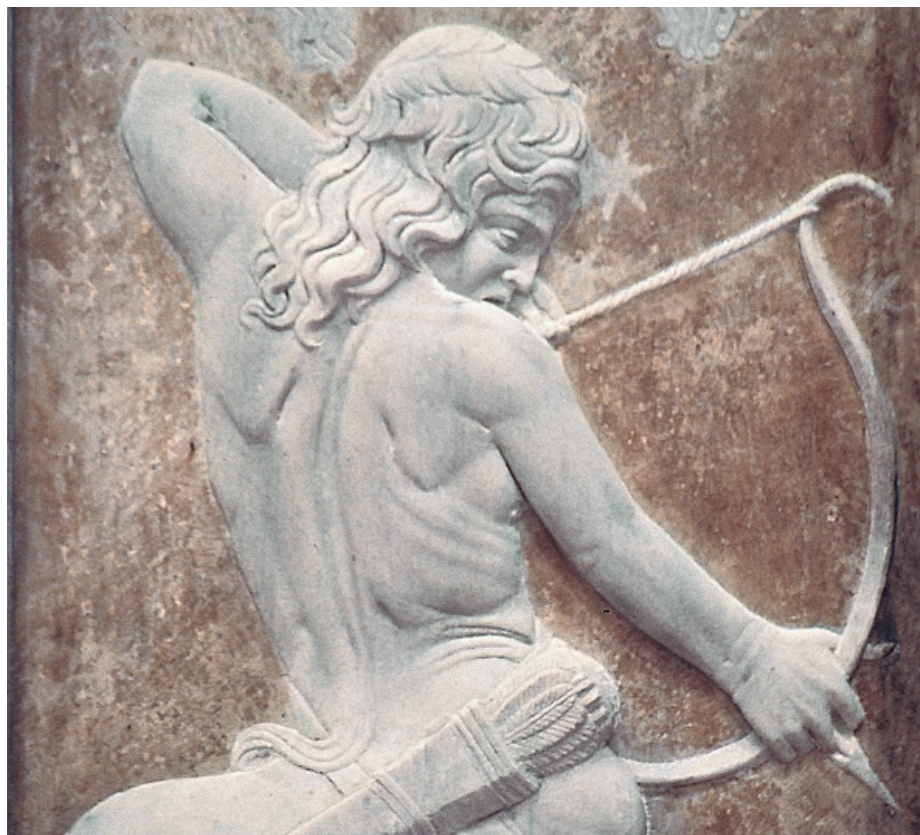
chapel known as "Chapel of the Planets": detail of a bas-relief by Agostino di Duccio, Malatesta Temple, Rimini